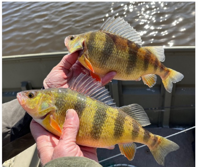
Glen Carter's nice double header: 1-1 and 1-0.