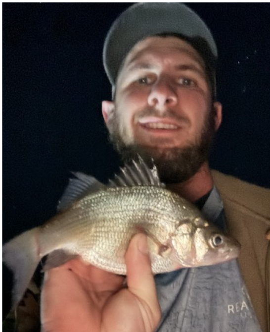
Below left: 8oz, 9” white perch caught on 8lb mono, below right: 35-13 blue catfish on 50lb braid.