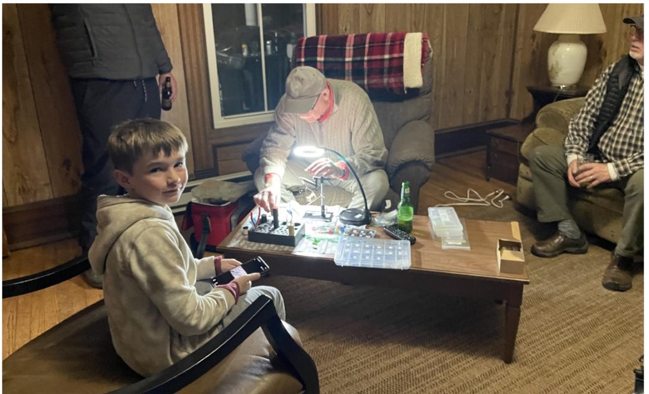
After a long day of fishing, fly tying! What a GREAT TRIP!!!