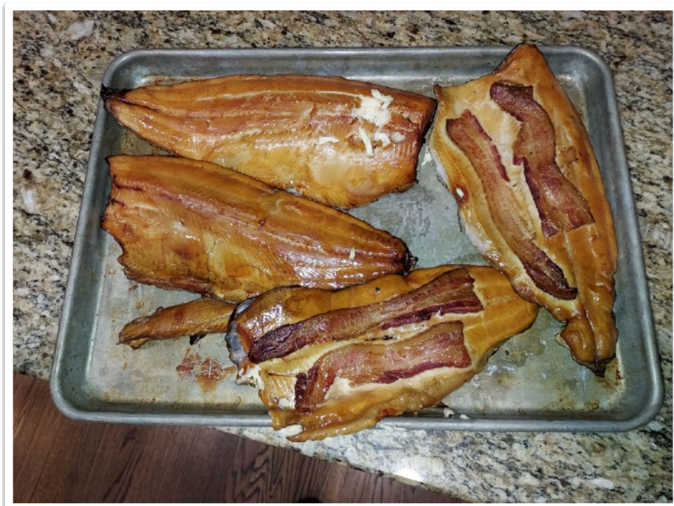
OMG...bacon and trout! What could be better? MMMMMMMMMM