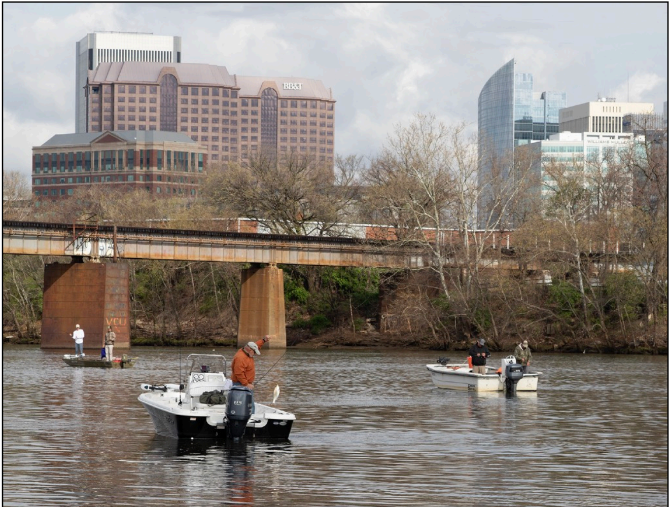
GET READY FOR SHAD FISHING SEASON!!!