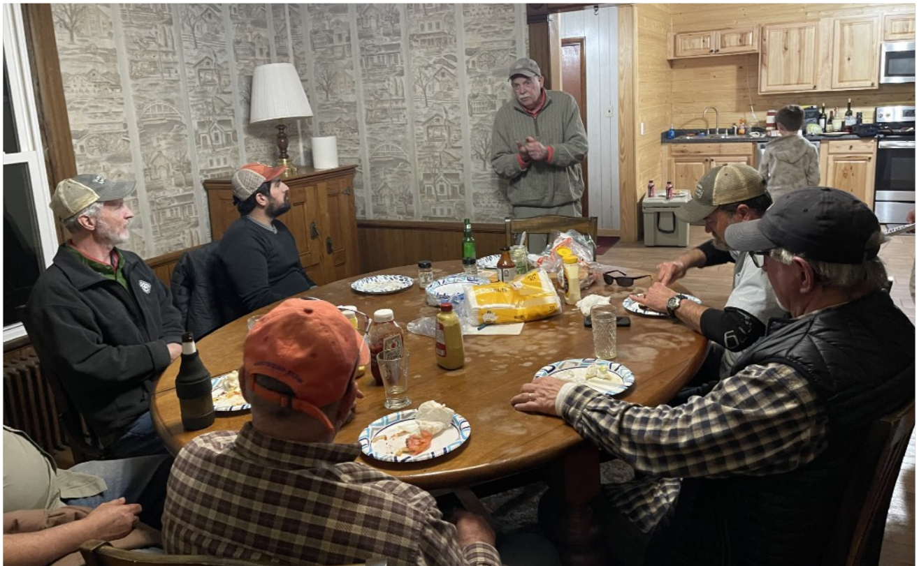
Hanging out and warming up after a group evening meal! Great fellowship!!!