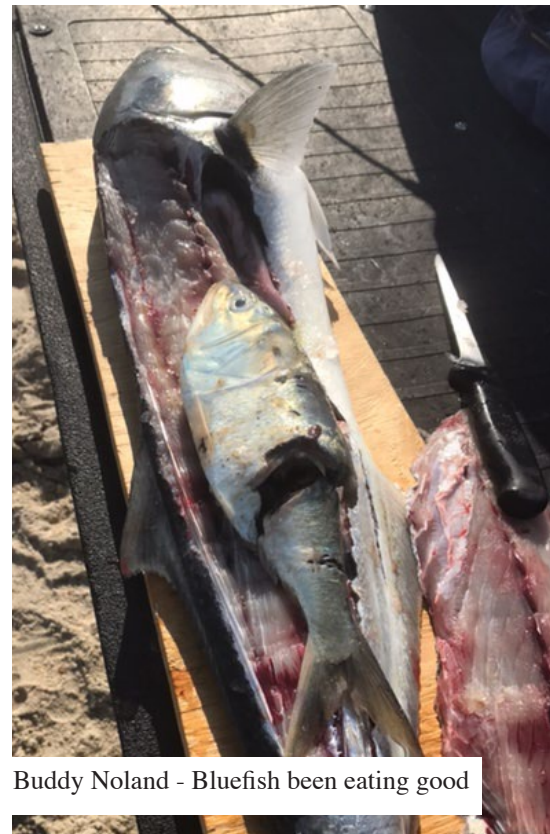
Buddy Noland - Bluefish been eating good