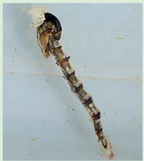
Pupa of a Chironomid

The Ice Cream Cone fly was developed in 1992 in British Columbia. It is made to resemble the pupa of a chironomid, an insect resembling a mosquito.