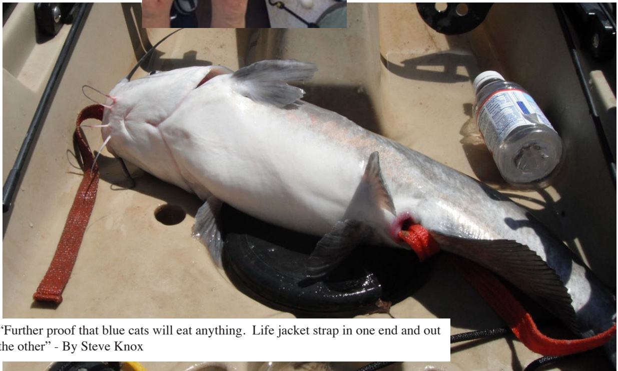
"Further proof that blue cats will eat anything. Life jacket strap in one end and out the other" - By Steve Knox