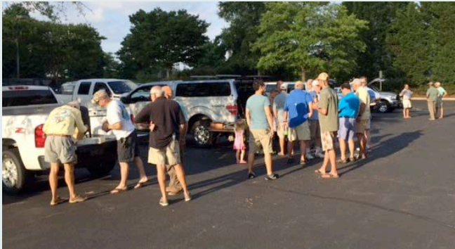
VAC Members Shopping The June 28th Swap Shop

Many Virginia Anglers Club Members took advantage of great prices at the Annual Swap Shop held before the June Membership Meeting. Fishing tackle and electronics were the main items offered for sale. Also available for purchase was a nice selection of accessories (landing nets, a smoker, etc).