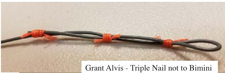
Grant Alvis - Triple Nail not to Bimini