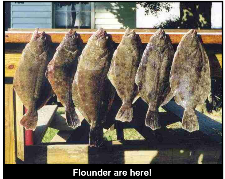
Flounder are here!