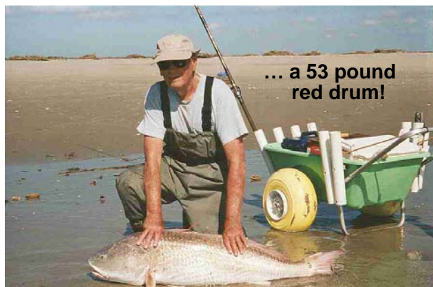
... a 53 pound red drum!