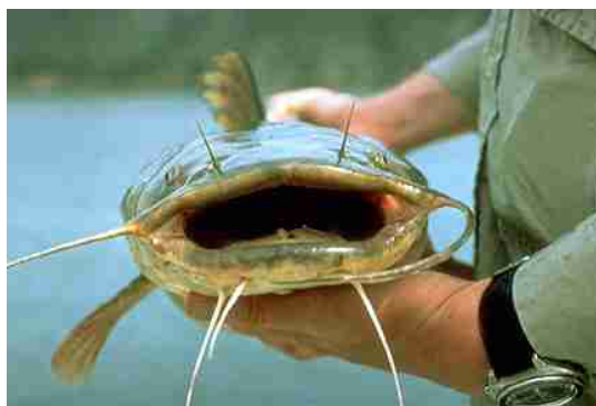
Flathead Catfish, Pylodictis olivaris